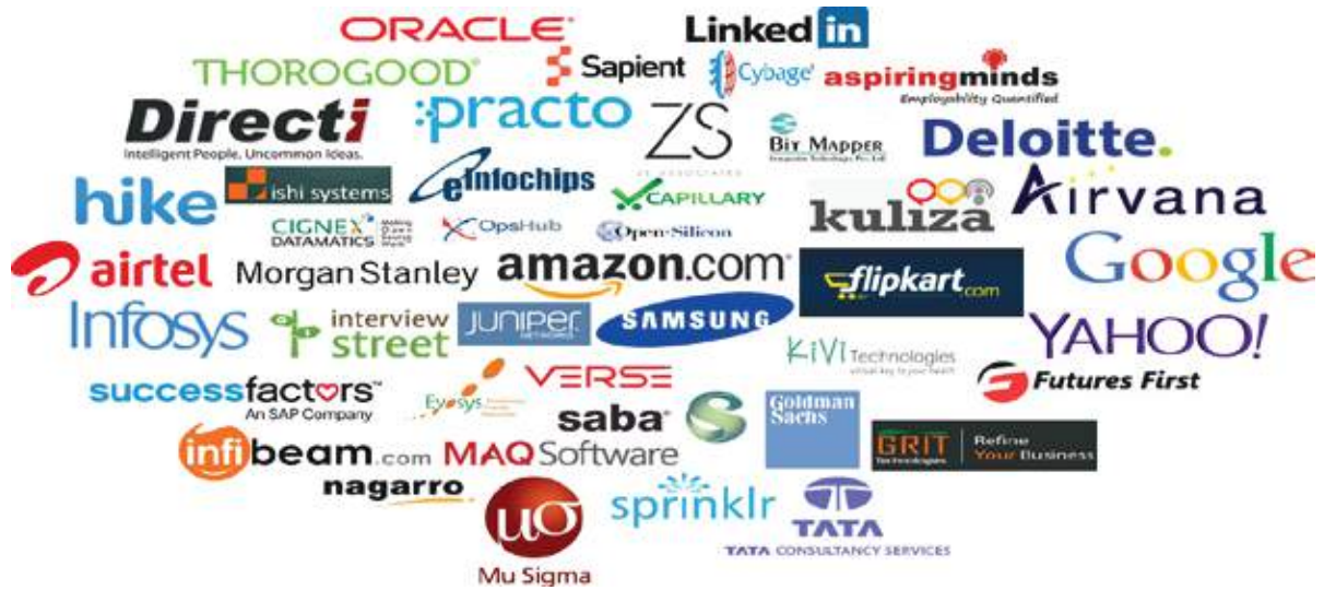
Pool of Visited Companies at DA-IICT